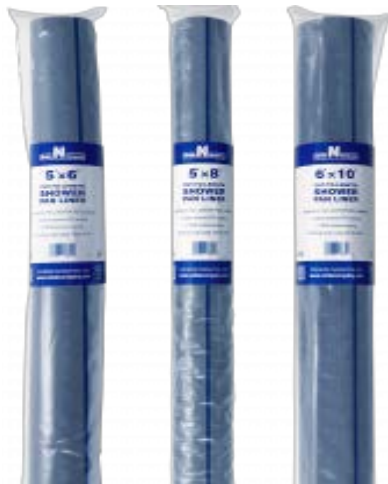
NOBLE PVC SHOWER PAN LINER 40 MIL 5'x6' - (30 sf) / 5'x8' - (40 sf) / 6'x10' - (60 sf)