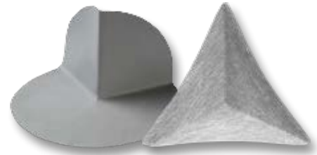
NOBLE PVC OUTSIDE AND INSIDE CORNERS