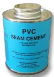
NOBLE PVC SEAM CEMENT PINT