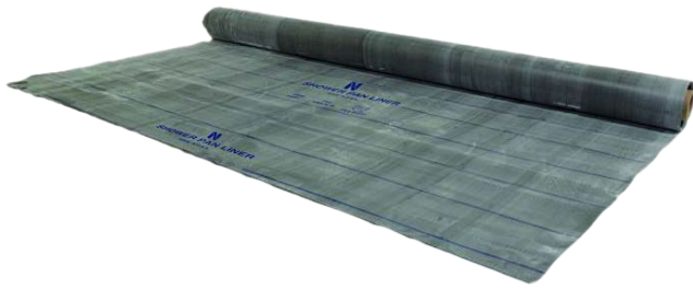
NOBLE PVC SHOWER PAN LINER 40 MIL 5'x100' - (500 sf) / 6'x100' - (600 sf)

700 North South Road Scranton, PA 18504 - Phone: (800) 233-4107