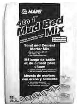
4 TO 1 MUD BED MIX 55lb bags